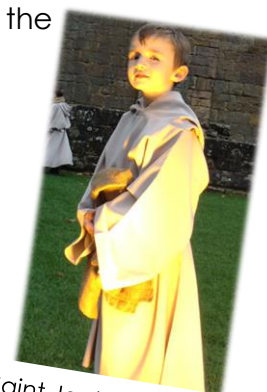
Saint Jack, positively radiating!