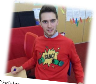
A Christmas Cracker-pot, Cracker...